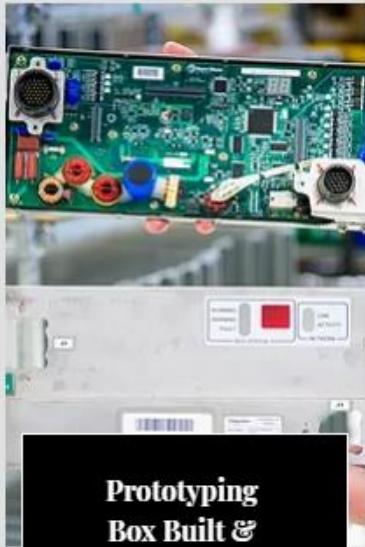
Prototyping Box Built & PCBA