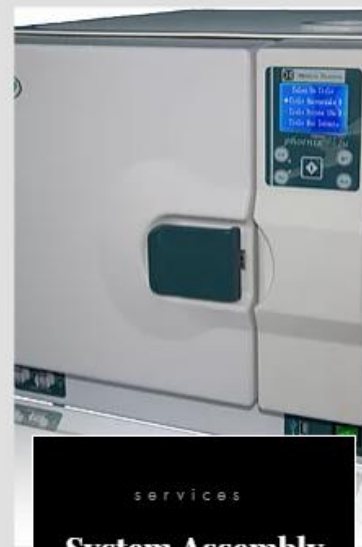
services System Assembly