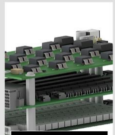
services Printed Circuit Board Assembly

The quality of our electronic productions ensures your customers a reliable and safety product.